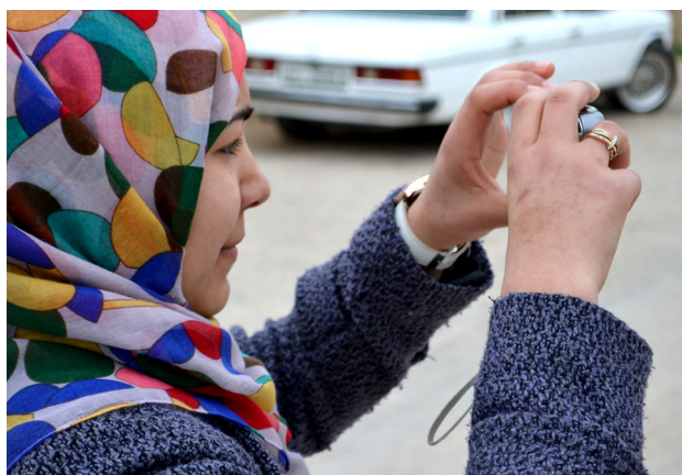
Female adolescent, Jordan

Syrian, Jordanian and Lebanese adolescents in Hartha, Saida and Baalbeck, and boys in Mafraq, resented the poor quality of education both in terms of teacher capacity and, for Syrians, curricular content. One Syrian adolescent commented, “Our history teacher taught us seven chapters in one class,” revealing the potential drop in quality that results from accelerated education. Syrian adolescent boys in Jordan also reported being placed in school based on their age even though they had been out of school