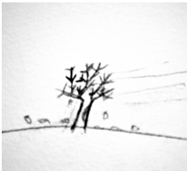
Male adolescent, Lebanon

Youssef’s tree serves as a powerful analogy that guides how Mercy Corps approaches programming for adolescents. It is helpful, as Youssef’s tree and quote represent, to approach program design by detailing the “wind,” what we refer to as the barriers that impede adolescents from developing into peaceful and productive young adults, as well as the “soil and roots,” what we refer to as the enablers that promote adolescent development.