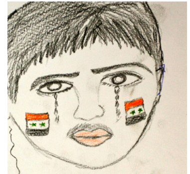
Female adolescent, Lebanon

All adolescent segments were keenly interested in broadening their social support networks and utilizing those networks for individual and collective expression through sport, art, photography, theatre, cooking and crafts and digital and social media. These expressive activities were described as an essential building block for establishing trust, building self-esteem and confidence and encouraging teamwork; all critical foundations for the community-involvement activities described below. These activities should be group-based, mix Syrian and host-community adolescents when feasible 24 and be facilitated by trained and trusted Syrian and host-community mentors of the same sex as the adolescents they work with.