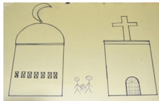
Female adolescent, Lebanon