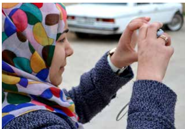
Female adolescent, Jordan

Syrian, Jordanian and Lebanese adolescents in Hartha, Saida and Baalbeck, and boys in Mafraq, resented the poor quality of education both in terms of teacher capacity and, for Syrians, curricular content. One Syrian adolescent commented, "Our history teacher taught us seven chapters in one class," revealing the potential drop in quality that results from accelerated education. Syrian adolescent boys in Jordan also reported being placed in school based on their age even though they had been out of school