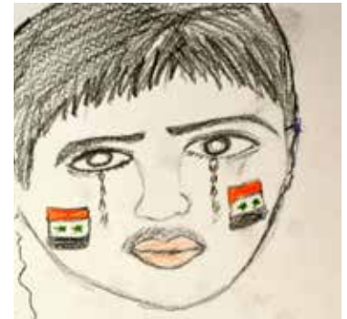
Female adolescent, Lebanon

All adolescent segments were keenly interested in broadening their social support networks and utilizing those networks for individual and collective expression through sport, art, photography, theatre, cooking and crafts and digital and social media. These expressive activities were described as an essential building block for establishing trust, building self-esteem and confidence and encouraging teamwork; all critical foundations for the community-involvement activities described below. These activities should be group-based, mix Syrian and host-community adolescents when feasible 24 and be facilitated by trained and trusted Syrian and host-community mentors of the same sex as the adolescents they work with.