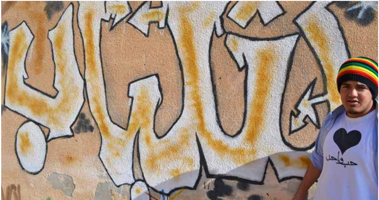
Graffiti reads “Youth” and artist’s shirt reads “One Love”