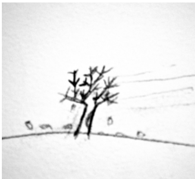
Male adolescent, Lebanon

Youssef’s tree serves as a powerful analogy that guides how Mercy Corps approaches programming for adolescents. It is helpful, as Youssef’s tree and quote represent, to approach program design by detailing the “wind,” what we refer to as the barriers that impede adolescents from developing into peaceful and productive young adults, as well as the “soil and roots,” what we refer to as the enablers that promote adolescent development.