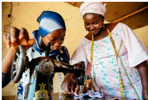
An adolescent girl learning to sew from a tailor in her village. Her apprenticeship was the culmination of a nine-month financial literacy course, established by a Mercy Corps program working to empower vulnerable Nigerian girls. Photo Credit: Corinna Robbins for Mercy Corps | March 2016

Ultimately, Mercy Corps Nigeria designs projects to help reduce the pool of people at risk of protection issues and strengthen their capacity to navigate the risks they face. Using the "I'm Here Approach," Mercy Corps' adolescent programming seeks out and works with adolescents that are the most marginalized, less likely to have safe, dignified and inclusive access to community assets and available services, and who are at a high risk of using negative coping mechanisms to get by. Tailored interventions are designed to meet specific needs, conjure assets, build relevant knowledge and skills, and enable safe opportunities and support for unique groups of adolescent girls and adolescent boys that help create an enabling environment for them to mitigate the risks of their lives and thrive. Mercy Corps' conflict mitigation team works with diverse communities with different priorities and agendas to find common ground, social cohesion, and to be responsive to flash points that can potentially create tensions between communities and risk the safety of all community members.