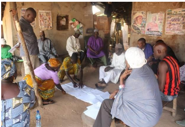
Community leaders in Nasarawa State participate in a needs assessment to analyze the linkages between a lack of social services and conflict. Mercy Corps then works with conflicting communities to identify shared social service needs and opportunities to collaboratively address shared challenges.

Mercy Corps recognizes that when intentionally designed to do so, various parts of its programming can influence outcomes that contribute to a safer, more dignified, and inclusive experience within the communities it works. Mercy Corps' protection team works with each program sector and project to help