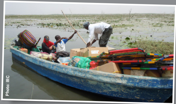
Photo: IRC Aid delivery in Lake Chad.

This experience marked a turning point in the IRC's Diffa response in three ways: it expanded the number of sectors in which the IRC worked; it was the first rapid emergency response launched; and it demonstrated the potential of information sharing as an advocacy tool to increase the responsiveness of the wider humanitarian community.