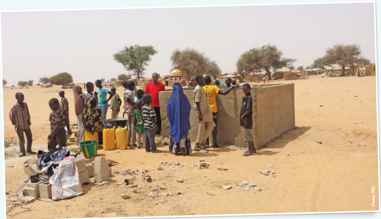
Villagers in Diffa line up to collect water from one of three wells constructed by the IRC in the remote villages of Gagamari and Chetimari.

Despite these adaptive capabilities and enablers, the IRC efforts in Diffa have struggled with many of the same procurement procedures and government restrictions that plague other response efforts. Few program contexts are perfectly suited for adaptive management. What stands out in this case is the interconnections between various adaptive capacities to create a more enabling environment, and to compensate for the inhibitors that exist.