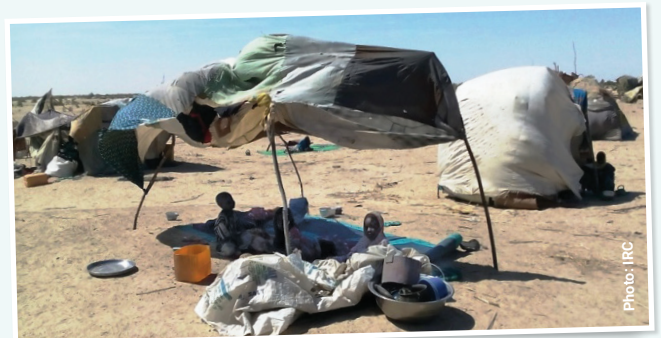
IDP/refugee settlement in Diffa.

The diversity of activities and rapid increase in funding have both depended on the response team's ability to track changes in the context and react quickly, working with the rest of the humanitarian community, despite challenges from procurement procedures and government restrictions.